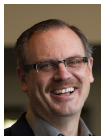
Dale Woods Middle East